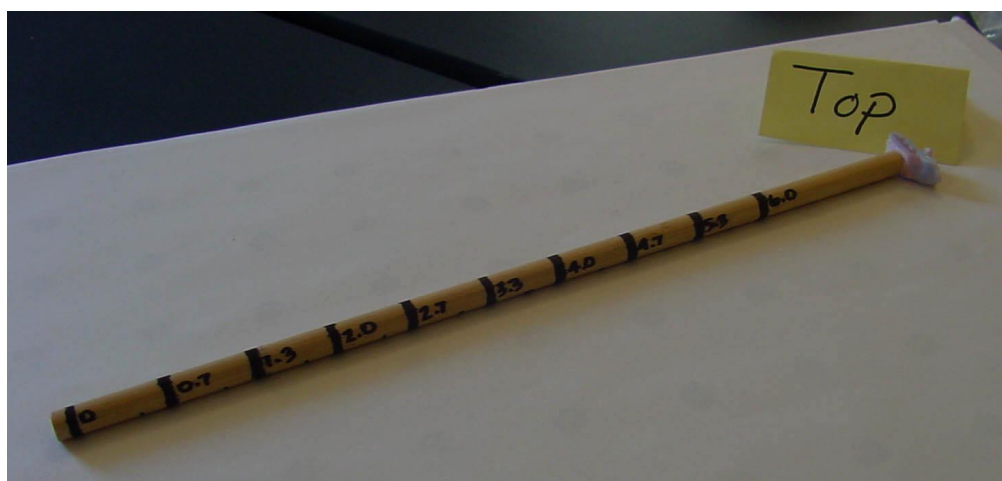
Photo of dowel, which represents the sonar signal used to measure the seafloor.